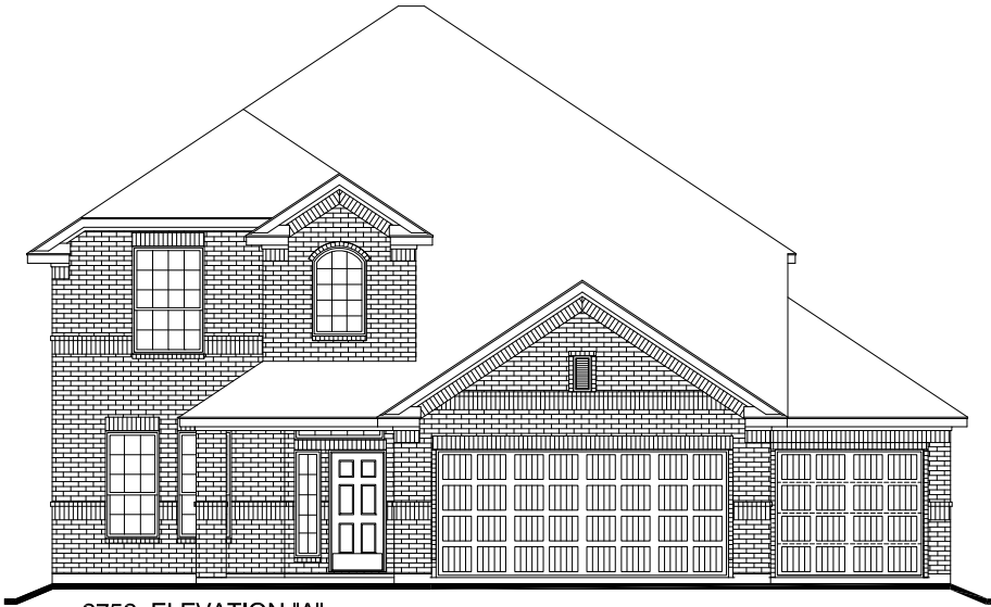
2752 ELEVATION "A"