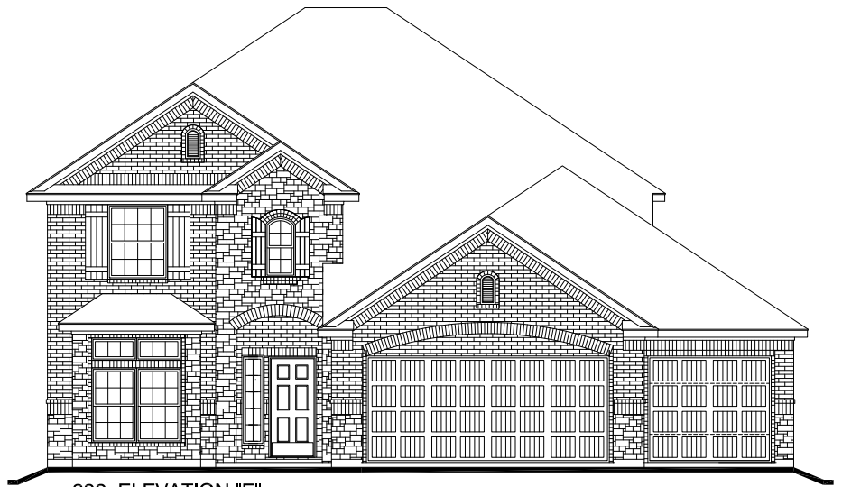
832 ELEVATION "E"