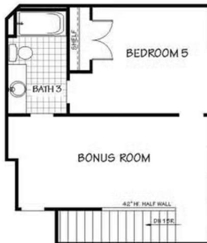
OPTIONAL BONUS ROOM (BDRM #5 w/ BATH 3)