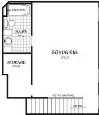
OPTIONAL SECOND FLOOR BONUS RM. w/ BATH 3

2101 sq. ft. +/- (With Bonus Rm., 2661 sq. ft. +/-)