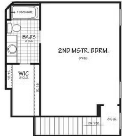
OPTIONAL SECOND FLOOR 2nd MASTER BDRM