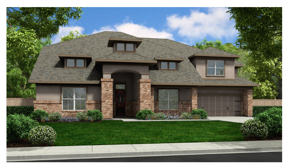
4296 ELEVATION "C"